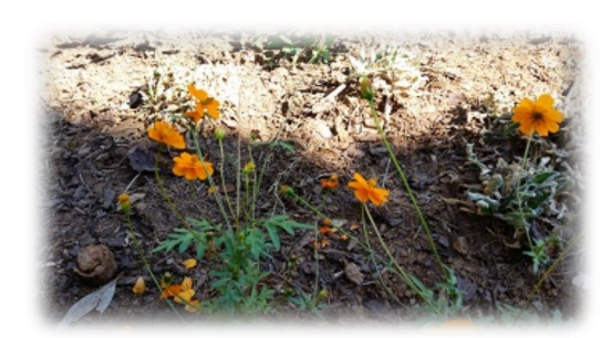
UFO —Unidentified Flowering Objects