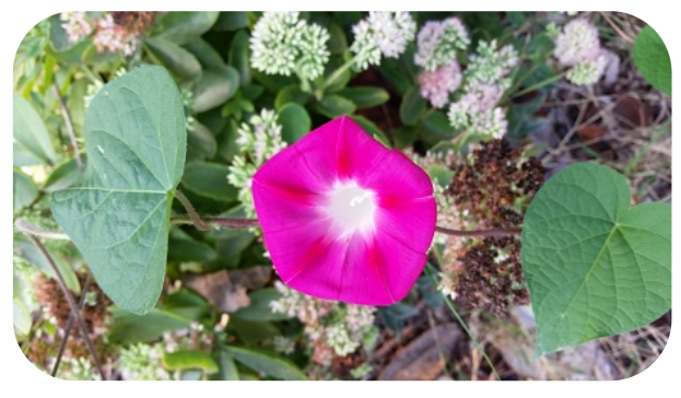
A Morning Glory amongst the Sedum