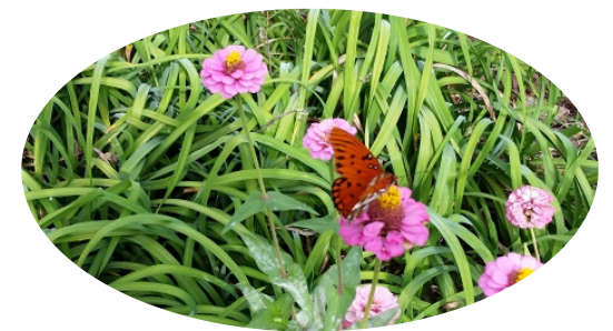
Butterfly on Zinnia