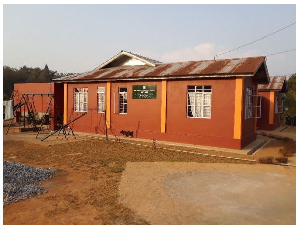
Current Children's Village (orphanage)