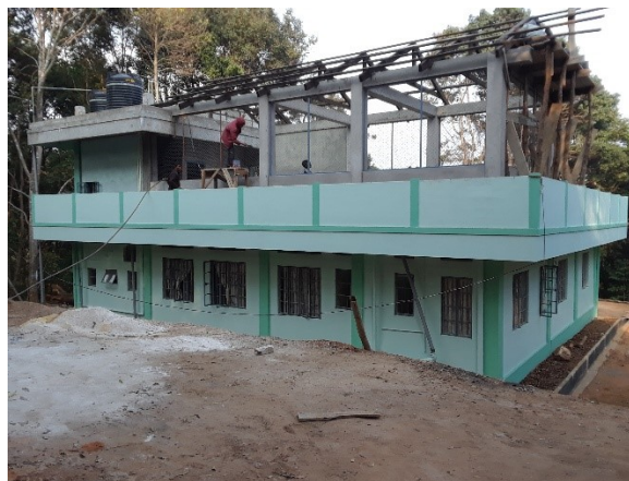
Children's Village new construction underway