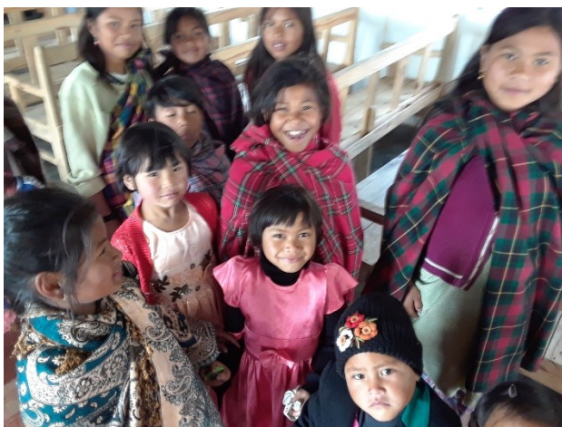
Beautiful Khasi children at the Mawsynjri church