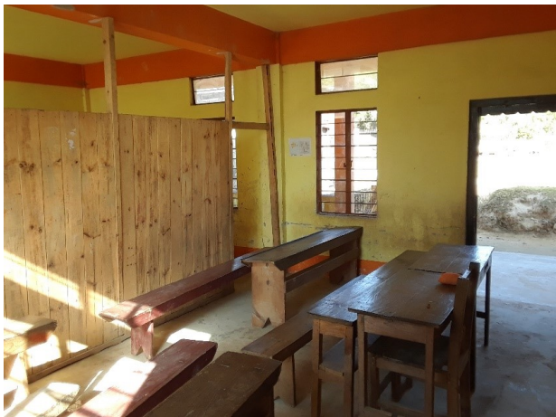
Classroom under construction