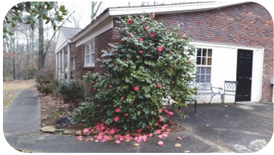
The Discovery Hall Camellia