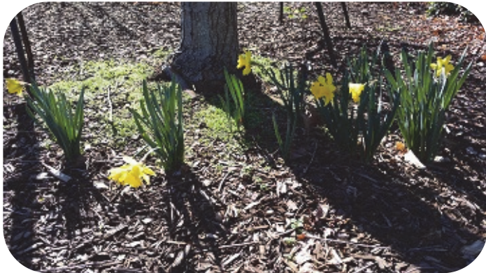
A Group of Daffodils