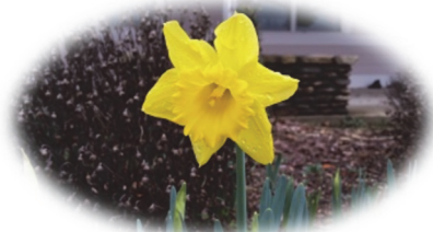
The First Daffodil