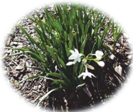
Narcissus—they just appeared this year