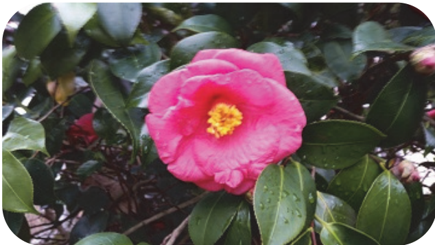
Close up of a Camellia