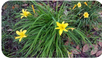
Stella de Oro Daylily