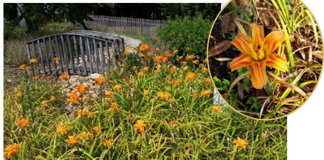
Field of Orange Daylilies