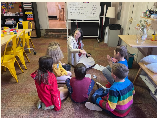
Learning about different holiday traditions