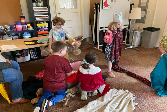
Dress up at rehearsal

The month of December was packed full of fun memories!