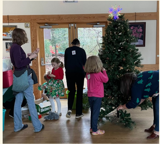
After enjoying a fun game between youth and adults, the kids worked hard decorating the tree