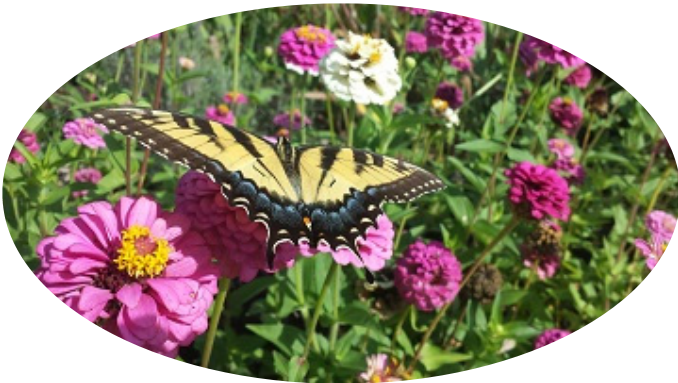
Black and Blue Swallowtail on the Zinnias