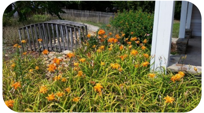
Field of Daylilies