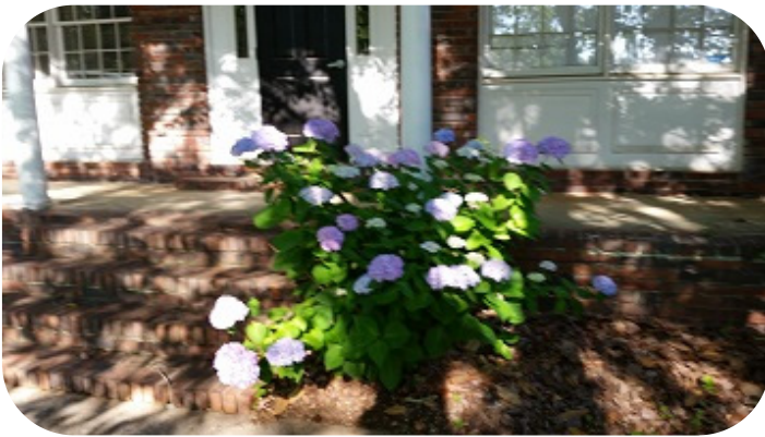
Hydrangea in Front of Discovery Hall