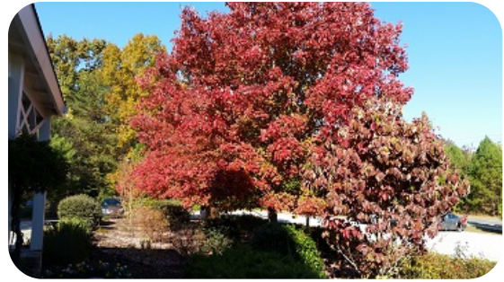
Autumn at UUMAN