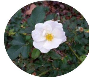
A Single White Camelia