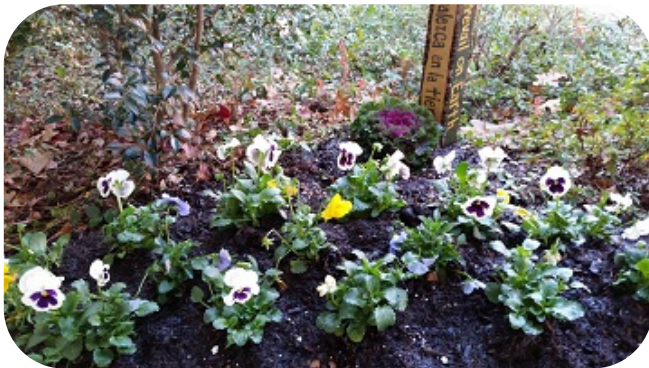
Pansies around the Peace Pole