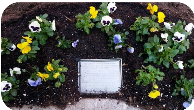
Pansies in the Meditation Garden