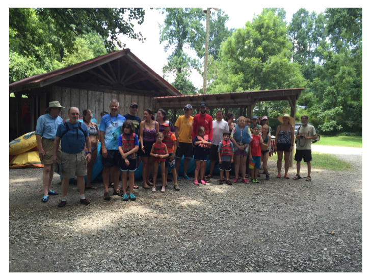
The cost is $6.00/person and includes a tube and the shuttle to the starting point on the river. For those energetic folks you can float down the river multiple times just by walking back to the start along a path beside the river each time you finish.

Earth Ministry is sponsoring a tubing trip on September 2 on the Chestatee River outside Dahlonega, GA. This is a fun event for the entire family - young and older. The river is absolutely beautiful; about knee deep in most places and lined with tall trees that provide shade most of the trip. We had a large group in 2016 (picture below).