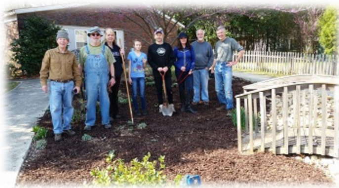
The Gardeners on the First Work Day, March 20, 2017