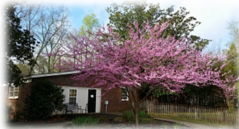
Redbud in Bloom

UUMAN Gardening Group cbsullivan@bellsouth.net