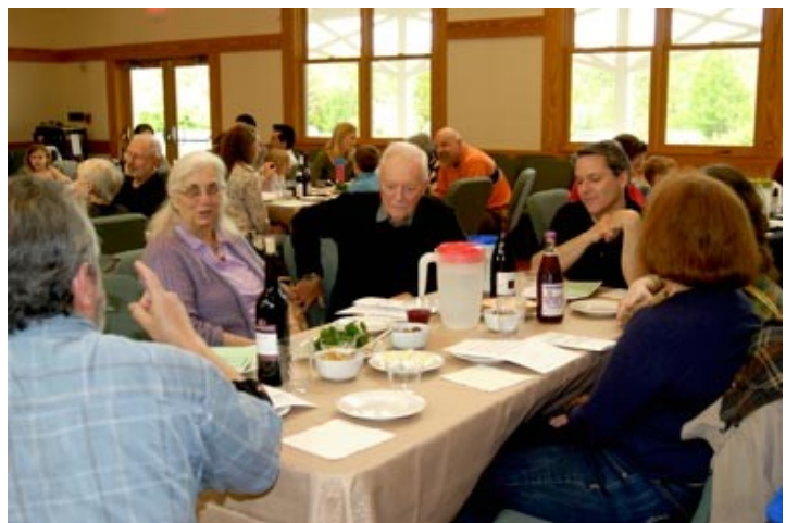
2014 Passover Seder at UUMAN