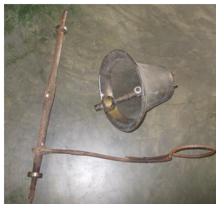
Mawsynjri Church Bell